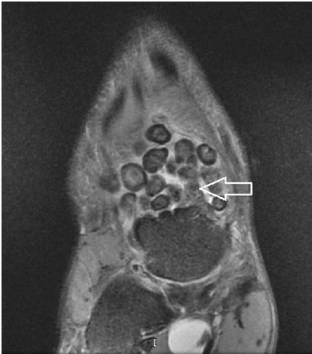
Figure 4: MRI (Coronal PD fat saturated image) of right ankle joint showing frond like hypointense synovium in the posterior aspect of knee joint (white arrow).