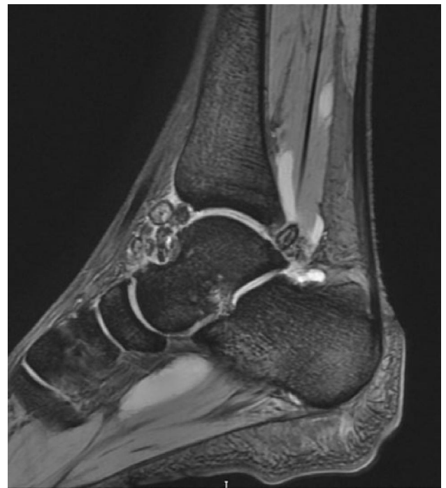
Figure 3: MRI (Sagittal GRE image) of right ankle joint showing increased prominence of loose bodies with typical target appearance.