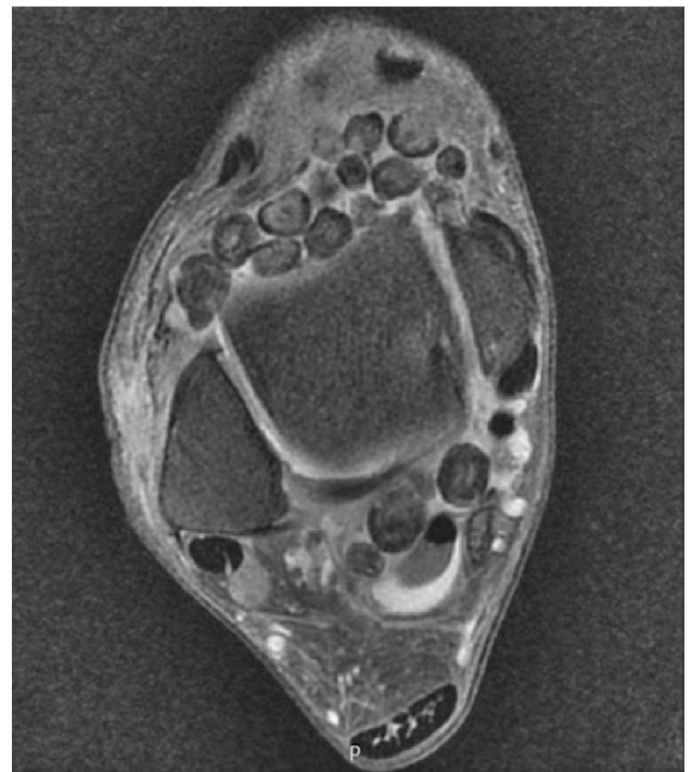
Figure 2: MRI (Axial PD fat saturated image) of right ankle joint showing no loss of signal in loose bodies.

Orthopaedic consult suggested surgery; however the patient choose to defer the surgery temporarily. He was started on conservative therapy for pain and asked to return on follow up.