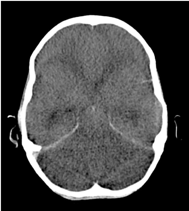
Figure 1: Dark cerebellar sign is characterized by hypodense cerebellum, which is a rare finding in neuroradiology.