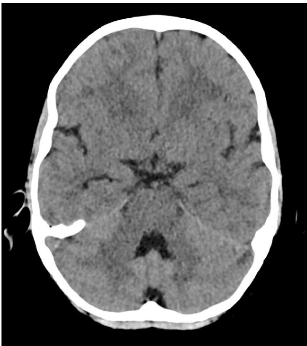
Figure 2: Normal density of cerebellum.

hypodensity of cerebellum can be attributed to the increased water content of injured brain. In regard to ischemic brain edema with each 1% increase in tissue water content X-ray attenuation will decline by