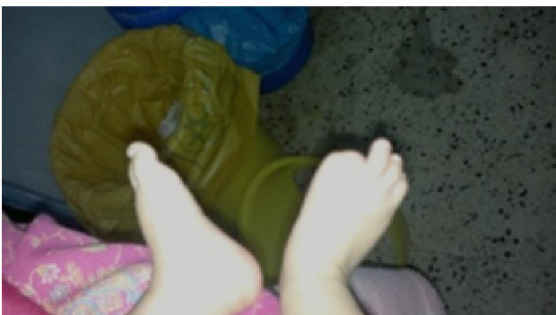
Figure 5: Picture of the feet showing absent Great and second toe of the right foot.

Figure 3 & 4: X-ray skull AP and Lateral views showing a soft tissue radiopaque shadow