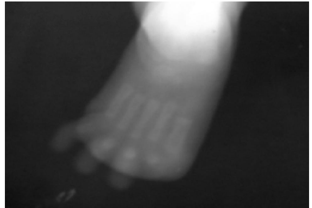
Figure 6: X-ray showing five metacarpals but absent Great and second toe.