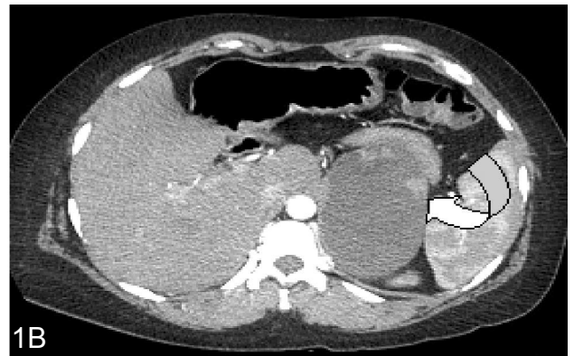
Figure 1a & b: Axial CT scan post contrast showing larger hypodense cystic area with mild enhancement of walls (curved arrow) along greater curvature and posterior wall of stomach (black arrow). another small intramural cystic lesion is seen within the wall of greater curvature and anterior wall of stomach (white arrow).

We report a case of 27 year old female who presented with complain of epigastric pain, nausea and vomiting. Her general physical examination and lab investigation (Hb, TLC and ESR) were normal. Her CT scan showed a hypodense cystic lesion involving the greater curvature of stomach, with loss of intervening fat planes between the lesion and gastric wall with another small exophytic intra mural hypodense lesion arising from fundus of stomach. No calcification is seen within the cysts. The HU of cysts are 8-10 and enhancement of the cyst wall seen after IV contrast, please see (Fig. 1 a & b) and (Fig. 2). These two intramural cystic appearing lesions represent duplication cysts.