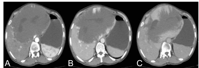
Figure 1: Contrast enhanced CT scan. Arterial phase (A), Portovenous phase (B) and delayed phase (C). Note peripheral enhancement of the mass on arterial phase with centripetal progression on venous and delayed phase images.

Correspondence : Dr. Basit Salam Department of Radiology, Aga Khan University Hospital, Stadium Road, P.O Box 3500, Karachi, 74800 Pakistan. Tel. No. 34930051- Ext 2020 E-mail: basit.salam@aku.edu