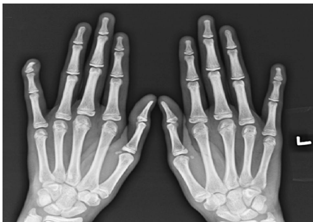
Figure 1: AP view showing ventro-radial angulations of terminal phalanx relative to middle phalanx with an apparent overgrowth of epiphysis on the palmar surface and a tiny bony spur, which projects distally and fits into a groove in the basal part of the shaft. Physeal plate appears widened with sharply narrowed and sclerosed diaphysis

Radiological findings are consistent, diagnostic and usually straightforward as in our case which shows ventro-radial angulations of terminal phalanx relative to middle phalanx with an apparent overgrowth of epiphysis on the palmar surface and a tiny bony spur, which projects distally and fits into a groove in the basal part of the shaft. Physeal plate appears widened with sharply narrowed and sclerosed diaphysis (Fig.1).