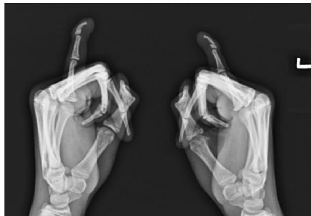
Figure 2: Lateral view shows palmar bending of the shaft, which is thinner than the epiphysis, a mortise-like pattern of the joint

A radiolucent nidus of 1-2 mm may be seen in terminal tuft. The articulation of the epiphysis with the middle phalanx is preserved. As the patient's age progresses, closure of the physeal plate with the diaphysis regains its width and trabecular structure. But the deformity, usually 10-50 degrees, persists. No spontaneous resolution of the deformity has been reported. Lateral view shows palmar bending of the shaft, which is thinner than the epiphysis, a mortise-like pattern of the joint (Fig-2).