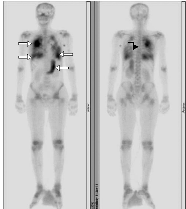
Figure 3: Whole body bone scan (anterior and posterior 3 hr delayed images) showing gastric and bilateral lung uptake (white thick arrows) and an ill-defined photon deficient area (thin black arrow) over T7 region.

showed epidural and para-vertebral soft tissue masses at C7-T1, T3-5 and T7-8 levels with contour abnormality of spinal cord and diffuse signal changes within cord substances. Whole body skeletal imaging(Fig.3)