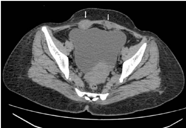
Figure 1: Isodense lesions on edges of Cesarean section scar