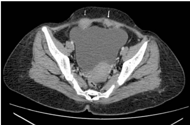
Figure 2: Lesions showing some post contrast enhancement.

excision of the lesions was done and it was sent for histopathological analysis which further confirmed the diagnosis.