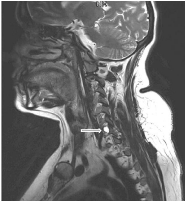
Figure 1: T2 weighted sagittal images demonstrate a well defined fluid signal intensity lesion in left C6-C7 neural foramen (arrow) closely related to facet joint