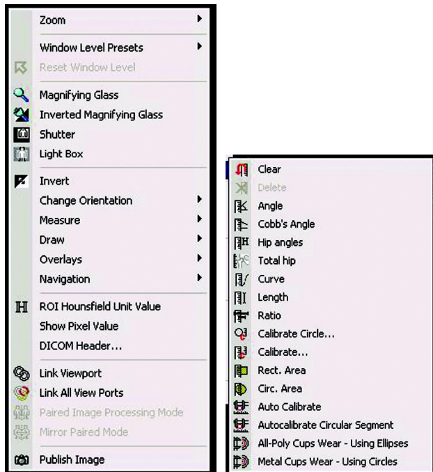
Figure 2: A Screenshot of a DICOM Image viewer showing various image enhancements options. (Courtesy: View Pro X , Rogan Delft Company).

image quality consistent on every monitor. Similarly, DICOM-based image archiving has a built-in function of lossless image archiving which further ensures clinical significance of medical images.