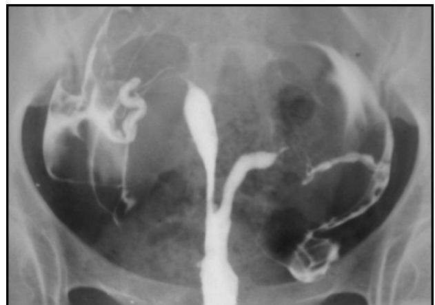
Figure 4: Bicornuate unicollis uterine cavity

Other modalities used for evaluation of cause of infertility include Ultrasound examination, Hysterosonography, Selective Salpingography and Fallopian Tube Catheterization, MRI, Hysteroscopy, Laparoscopy. Per abdominal/ transvaginal ultrasound both play an important role in evaluation of cause of primary infertility. Main indications include evaluation of uterine cavity and ovaries like polycystic ovaries, uterine fibroids, adenomyosis etc. Contrast material–enhanced sonohysterography, a relatively new modality has been suggested as a means of assessing tubal patency. 15,16 It does not however allow visualization of the entire tube.