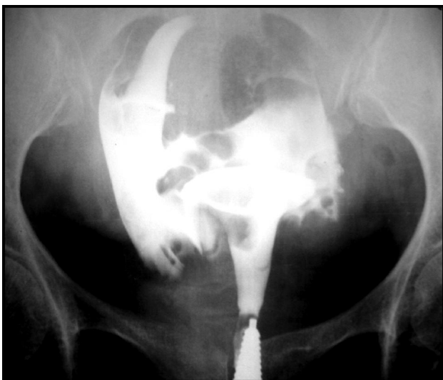
Figure 2: Multiple filling defects in uterine cavity (fibroids)