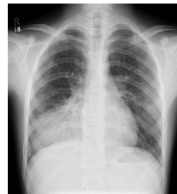
(1). Chest X-ray show consolidation of right lower lung zone.

He was managed conservatively with leukocyte count falling within range in following 4 days. Final blood culture report showed growth of Streptococcus pneumoniae. Patient was discharged on oral antibiotics. On follow-up his symptoms significantly subsided.