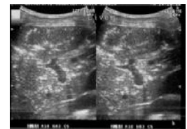
(2 & 3). Ultrasound images show densely echogenic foci within portal venous trunks and in portal radicals in liver parenchyma