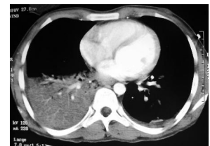
(5). CT section through lung bases, show consolidation of right lower lobe.