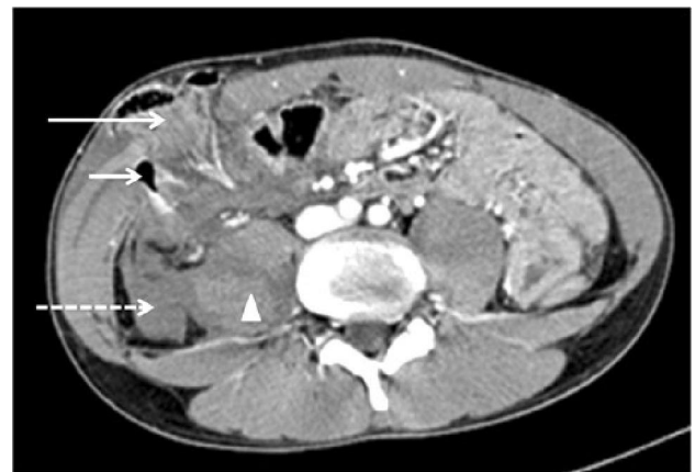
Figure 1: CECT showed right anterior abdominal wall defect with hernia (long arrow), air-pockets due to extra luminal gas (short arrow), haemoperitoneum (dashed arrow) and rectus muscle hematoma (arrow head).

psoas muscle was swollen with hypodense hematoma (Fig. 1, 2). Fluid was seen in the Morison's pouch and in the pelvis. The liver, spleen, pancreas and both kidneys were normal.