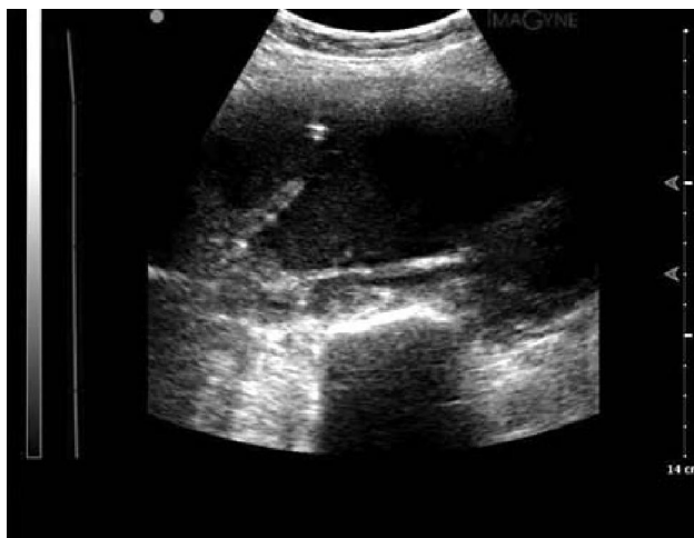
Figure 2: Ultrasound image during aspiration of the iliopsoas abscess with the draining trocar shown (arrowed).

aspiration was done using an 18G trocar and stylet assemblage (Fig. 2). About 8 ml of very viscid fluid