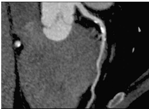
Figure 2: Showing deep bridge with grade 2 stenosis in the artery proximal to bridge

By using MPR and CPR, the affected artery in the MB was visualized, and then the artery's stenosis calculated. The classification of the stenosis was based on the American Heart Association's standards, called Nobile classification. The stenosis was divided into three grades 1: <50% stenosis 2: 50-75% stenosis 3: ≥75% stenosis. This study is focused on the stenosis in the artery proximal to the bridge.