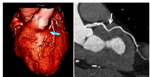
Figure 2: Multi Detector CT (MDCT) angiogram showing proximal LAD segment (arrows) in a deep myocardial bridge (> 2 mm).

With previous scanners, detection of coronary abnormalities was difficult due to the use of thick scan slices. However, we are now able to utilize thinner scan slices to evaluate coronary artery abnormalities using MDCT. MDCT is non-invasive and is very useful in calculating the length and depth of a bridge. When the bridge covering is thin, they can be calculated with MDCT rather than CAG and the detection rate of 3.5-58% is higher than that of CAG. With the use of multiplanar reformation and curved planar reformation in MDCT, we can calculate luminal diameter, course of the affected artery and the anatomical relation of coronary arteries. With superficial bridges, the covering is thin and might be missed with CAG because it does not show bridge compression, but with MDCT we can see the membranous myocardium covering the artery. A bridge is said to be deep when it has \geq 2 mm covering the artery (Fig. 2). A study has mentioned that with the use of MDCT, a greater presence of calcium deposition in the MB-free coronary artery than the bridged artery has been observed, which is dependent upon the surrounding adipose. 35