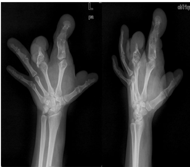
Figure 1: X-rays of left hand. Enlarged and deformed fingers and diffuse soft tissue swelling of hand. Evidence of previous surgery in middle finger.

nerve beyond mid forearm up to the wrist joint. Thickened nerve and its fascicles were hypointense on T1, T2 and STIR sequences with volar bowing of flexor retinaculum. Large amount of fat surrounding the nerve fascicles beyond flexor retinaculum took a mass like shape in the region of palm where they had characteristic coaxial cable like appearance on axial plane and spaghetti like appearance on coronal plane. Bony details were same as noted on plain x-rays. So the diagnosis of fibrolipomatous hamartoma of median nerve with macrodystrophia lipomatosa and carpal tunnel syndrome was confidently made.