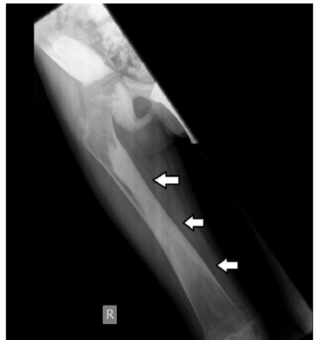
Figure 3: Radiograph of left femur showing diffuse diaphyseal hyperostosis

canals due to hyperostosis was noted. The optic nerves were compressed in the optic canals (Fig 2). Sclerosis is also seen in the region of petrous part of temporal bone which may be the reason for hearing loss. Sclerosis of the visualized upper cervical vertebrae was also seen. Findings were suggestive of Camurati-Engelmann's disease. After discussion with the primary physician radiograph of left femur was performed which revealed diffuse diaphyseal hyperostosis (Fig 3).