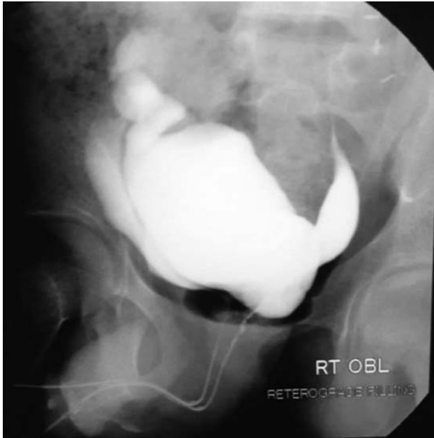
Figure 3: Retrograde Urethrogram: The two urethra were draining both bladders separately. Both urinary bladder lied side by side and reflux of contrast also noted in left ureter.

So, all these findings are suggestive of Type III urethra complete duplication with saggital type urinary bladder duplication.