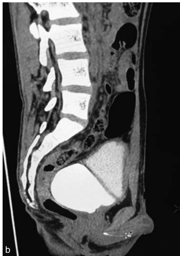
Figure 2: Reformed coronal and sagittal CT scan Images showing urinary bladder duplication in sagittal plane with left Transplanted kidney ureter with DJ draining into left hemi half of urinary bladder.

So CT scan urogram was confirmed duplication of urinary bladder and each urinary bladder received the ureter of ipsilateral native kidneys.