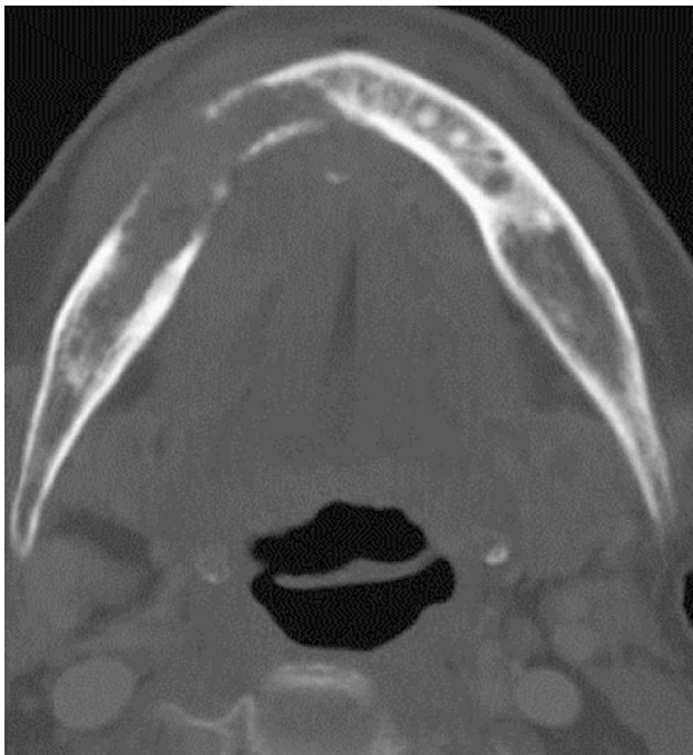
Figure 1: Axial section of CT scan (bone window) revealing oral carcinoma eroding adjacent mandible on right side.

The results of this study for evaluation of bony involvement (sensitivity 95.55%, specificity 95.85%, positive predictive value 97.7%, and negative predictive value 92%) are superior to studies of Brown et al, 21 Shaha et al 20 and Lane et al. 22 This in our belief is because of better imaging technique.