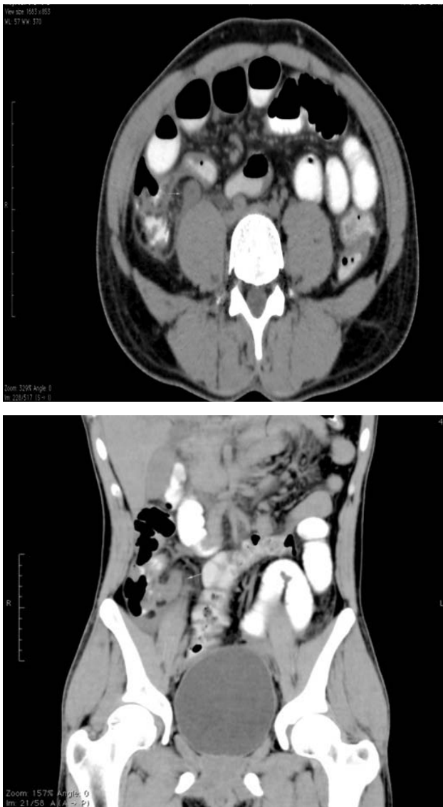
Figure 1: CT Fact shows dilated appendix (appendicitis) in right iliac fossa in axial and coronal views